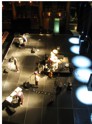
Arena Stage View From USL box

Check with CCPA Electrics department regarding availability of moving light package