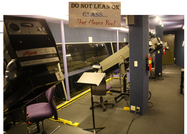
Follow Spot Booth

(96) Source 4 19° 750W (20) Source 4 26° 750W (4) PAR 64 (4) Colortran 5° ERS 1kw