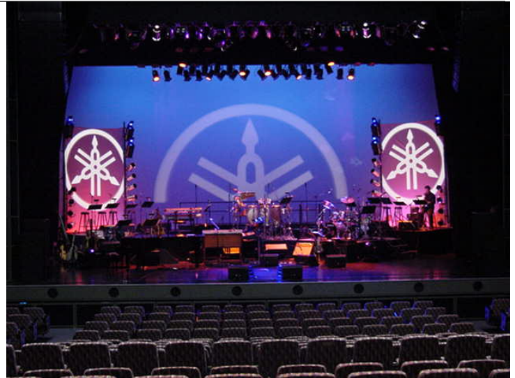
View from FOH - Lyric