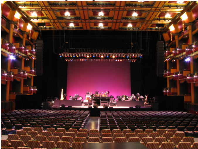
View from FOH - Arena

Available to all dressing rooms and backstage areas, controlled from Stage Manager's Desk